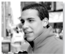
Adrift in Manhattan