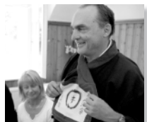
How To Cook Your Life